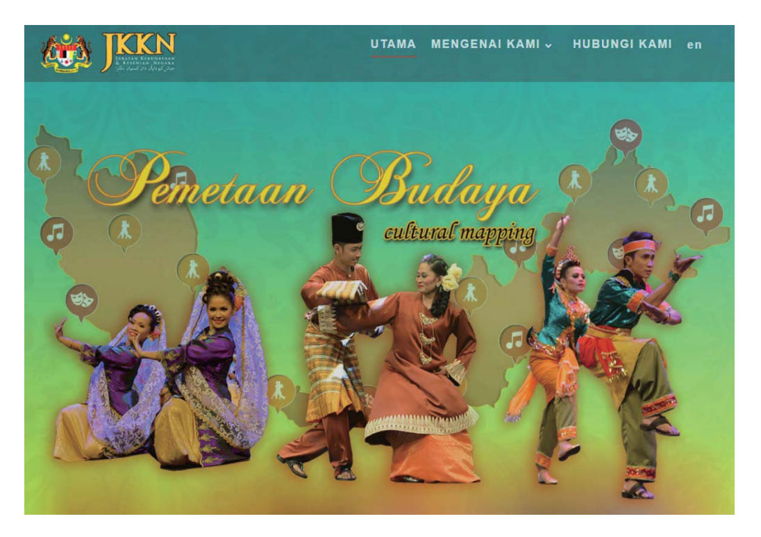
Figure 1 The Homepage of National Department for Culture and Arts' Cultural Mapping Portal

The National Department for Culture and Arts ( Jabatan Kebudayaan dan Kesenian Negara, JKKN ) established the Cultural Mapping portal<sup>10</sup> focusing on three main branches of performing arts: dance, music and (traditional) theatre. The portal contains information of performing arts and practitioners according to the state and district.